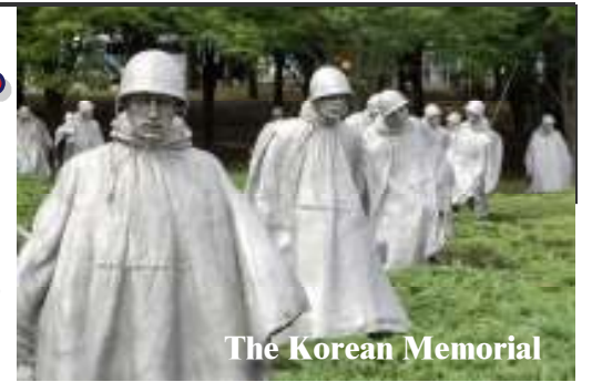
The Korean Memorial

Recently I had the privilege of visiting Washington DC thanks to a private veterans' program called "Honor Flights" that takes veterans to DC to visit 13 memorials: twenty-eight veterans dressed in red shirts, which they gave us and twenty-six volunteer helpers dressed in blue shirts, flew to Washington DC for two days. I also received a hat which said "Korea Veteran" on the front. Upon exiting the airplane in Baltimore, where we landed, there were about 200 people waiting to greet us when we came up the ramp from the plane. The clapping, cheering and hand shaking surprised and humbled all of us. We visited the World War II, Korean, Vietnam and Lincoln memorials to name just a few of the memorials we saw. Since I am a Korean veteran, I liked the Korean memorial the best, but they all were impressive. The hand shaking and the "Thank you for your service" greetings followed us throughout the city.